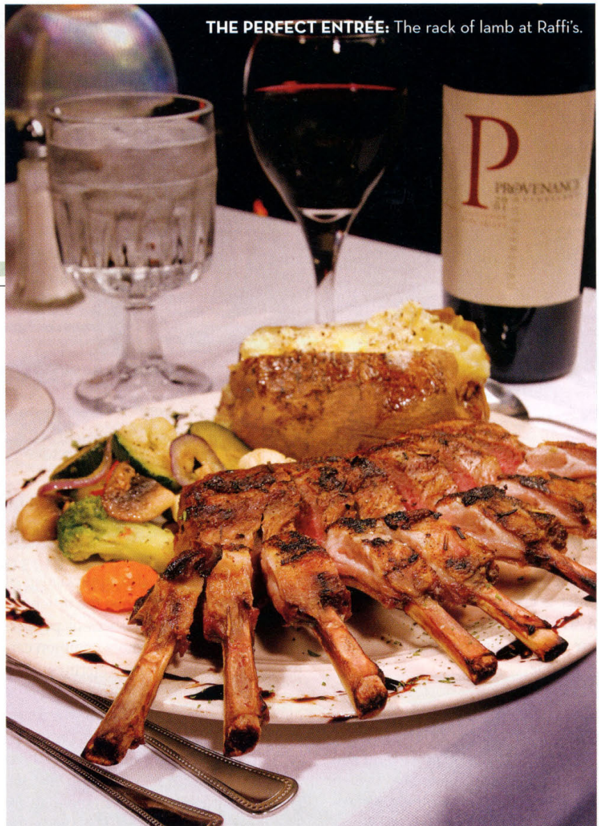
THE PERFECT ENTRÉE: The rack of lamb at Raffi's.

Our fantasy dinner begins with the sashimi appetizer at Bonefish Grill, 6401 E. Lloyd Expressway at Burkhardt Road. The restaurant, deservedly so, was among the “Best of Evansville” winners hailed in the November/December 2005 issue of our sister publication, Evansville Living . At Bonefish Grill, you can get an education in gourmet dining, which is how we learned that “sashimi” is the Japanese term for a raw fish delicacy served with compressed nuggets of “sticky rice.” The chefs at Bonefish Grill take a strip of yellow fin tuna and quickly sear it so it’s still raw in the middle; it’s then rolled in black sesame seeds and cut into thin slices. It’s served with soy sauce, wasabi (a potent Japanese horseradish) and pickled gingerroot, just as any self-