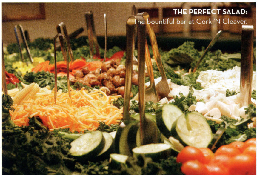
THE PERFECT SALAD: The bountiful bar at Cork 'N Cleaver.