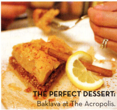
THE PERFECT DESSERT: Baklava at The Acropolis.